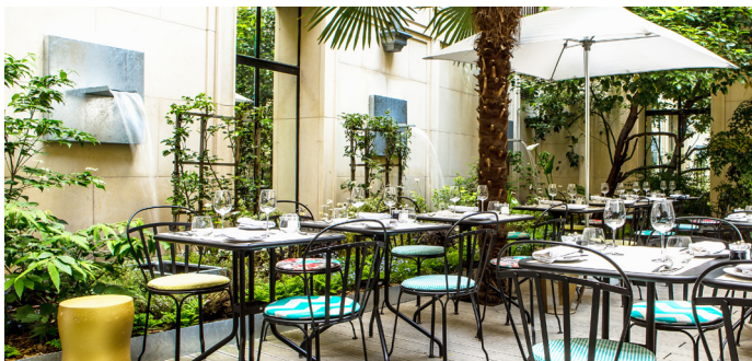
Blossom Restaurant's garden