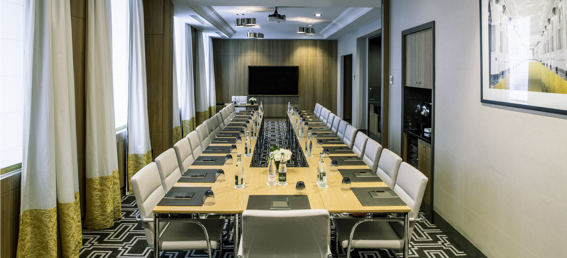
St Honoré Meeting Room